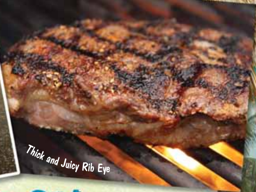
Thick and Juicy Rib Eye