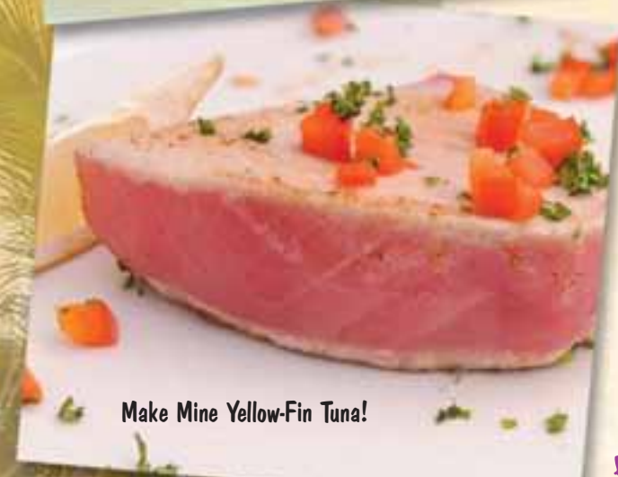
Make Mine Yellow-Fin Tuna!